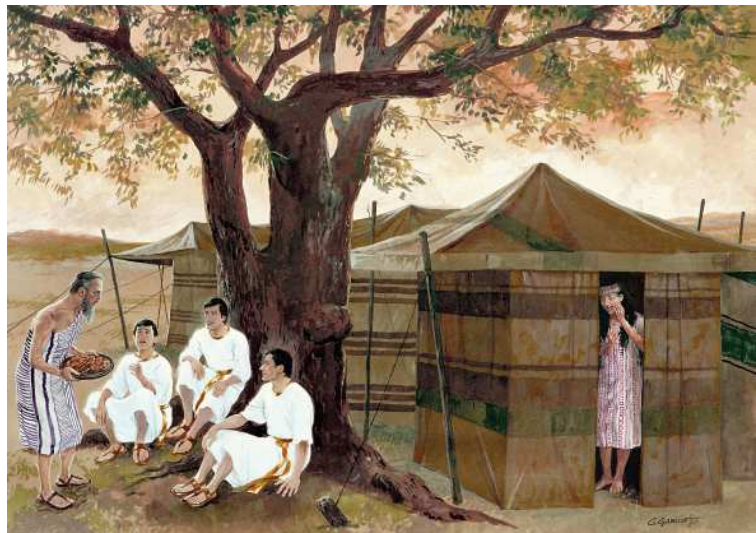
Show #15: Abraham fed the angels of the Lord at Mamre

Now Sarah, who was in the tent, heard this and laughed wondering how this could be since both of them were so old. The Lord reassured her that as he had spoken so shall it be in spite of the physical obstacles. He asked, “Is anything too hard for the LORD? I will return about this time next year, and Sarah will have a son.”