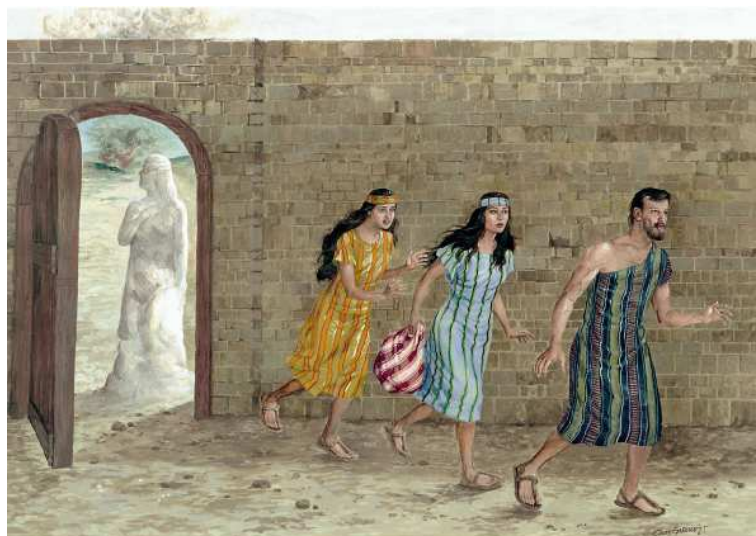
Show #16: Lot and his daughters fleeing from destruction

The angels’ warnings were clear to Lot. However, he hesitated to leave right away. Then the angels seized his hand and the hands of his wife and two daughters and they rushed them to safety outside the city. God was being very merciful to Lot. When they were safely out of the city, one of the angels ordered them, “Run for your lives! And don’t look