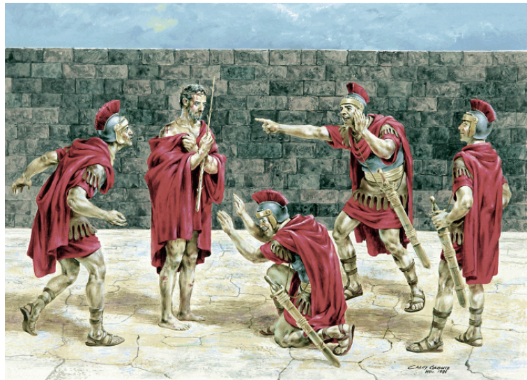
Show #86: The Roman soldiers torture and mock Jesus

The Roman soldiers scourged Jesus and mocked him. Showing no mercy or care for him, the Roman soldiers whipped Jesus with a lash which cut his skin and inflicted great pain upon him. The soldiers mocked Jesus by dressing him in a purple robe like a king wore. They made fun of Jesus and put a crown of thorns on his head. These thorns had very sharp points which inflicted much pain on the head of Jesus.