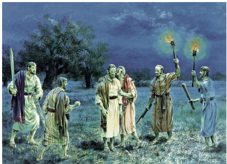
Show #84: Judas betrayed Jesus

Though Jesus was God, he was also a real man with a body like ours. He would feel the pain and suffer just like we feel pain and suffering. Even though Jesus knew everything that was going to happen to him and that he would suffer intensely, he willingly wanted to endure it in order to fulfill God’s plan and be our Deliverer.