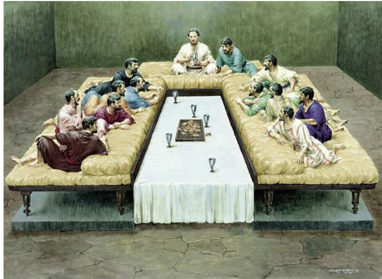
Show #82: Jesus last supper with his disciples

Jesus sent two of his disciples into Jerusalem to prepare for the Passover meal. He said to them, “When you have entered the city, a man carrying a jar of water will meet you. Follow him into the house that he enters and tell the master of the house, ‘The Teacher says to you, Where is the guest room, where I may eat the Passover with my disciples?’ Then the master of the house will show you a large, furnished upper room. Prepare the Passover meal there.”