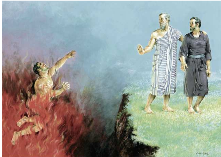
Show #79: The rich man in torment ... Lazarus with Abraham in paradise

One day Lazarus died. What happened to him? Where did his spirit go? When Lazarus died, God's angels carried his spirit to heaven to be with Abraham. Now his suffering was over. No longer would he long for the crumbs from the rich man's table. No longer would the dogs come and lick at his sores.