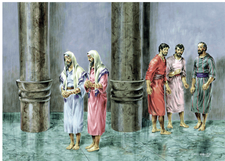
Show #72: The proud Pharisees

While they were praying in the temple, the Pharisee stood by himself and prayed, “I thank you, God, that I am not a sinner like everyone else. I don’t cheat, I don’t sin like others do, and I don’t commit adultery. I’m certainly not like that tax collector over there! I fast twice a week, and I give you a tenth of my income.” The Pharisee talked about all the good things that he did to impress God. He truly believed that God was impressed with his good deeds. He liked hearing his own words about how good he was before God and other people. He really believed that he was a much better person than others and didn’t sin like tax collectors.