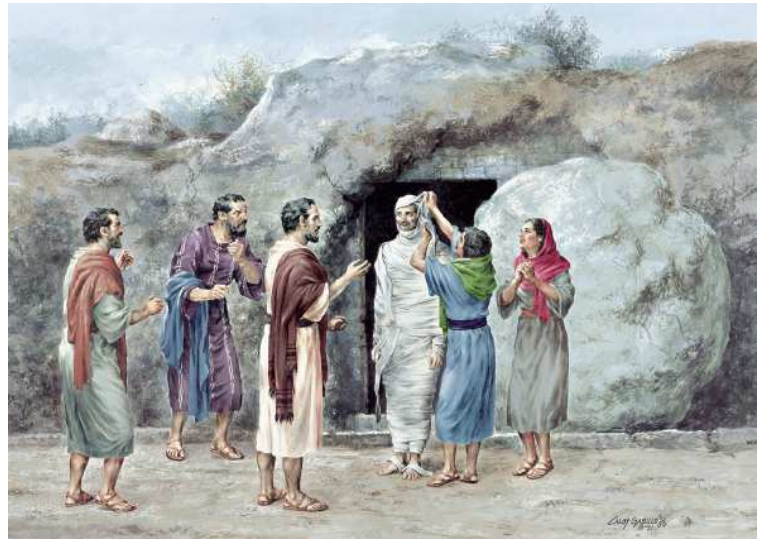
Show #74: Jesus raised Lazarus from the dead

Jesus wept because he was sad to see the heartaches of people because of sin and death. Jesus had compassion for the people because they suffered because of the consequences of sin.