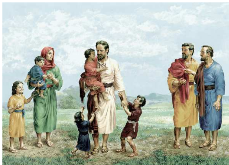
Show #76: Jesus loves children

The disciples were wrong. Jesus wanted to show love and care for the children. When he saw that the disciples were trying to keep the parents and their children away from him he was angry with them. He told them, "Let the children come to me. Don't stop them!" Jesus wanted the children to see that he loved them and cared for them. Jesus knew that children can also believe in him so he wanted them to come to him. As the disciples