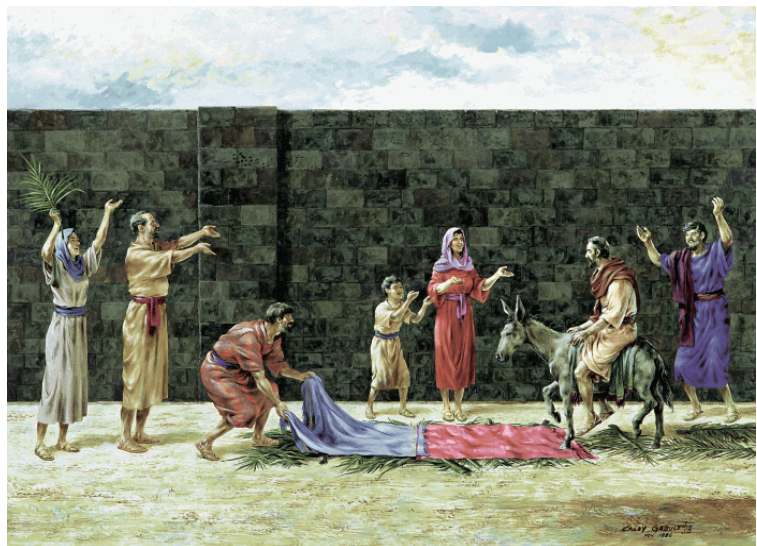
Show #81: The triumphal entry of Christ in Jerusalem

Most of the people who praised Jesus that day did not think about their sin problem. They believed they were okay and God would accept them for who they were. They were more concerned about their life on earth than with their problem of being a sinner. Jesus did not